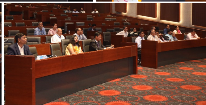
SPBB Annual General Body Meeting at NASC Complex, New Delhi

Proceedings of the AGM is available on the SPBB website: https://spbbindia.org/publications/